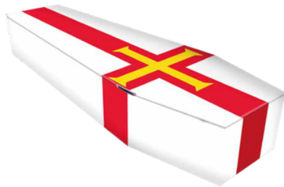
Colourful Coffin customisable design®